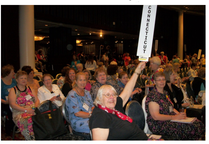
AKS members at First General Session