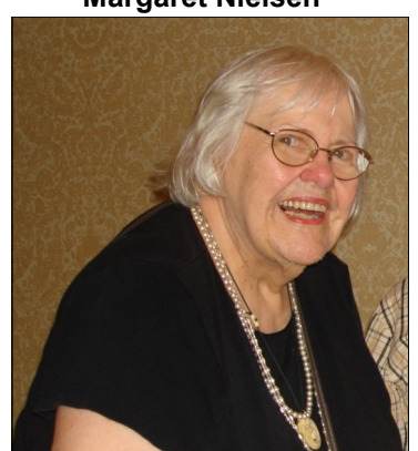
Your Tax Deductions Can Enable Future Opportunities for DKG Members